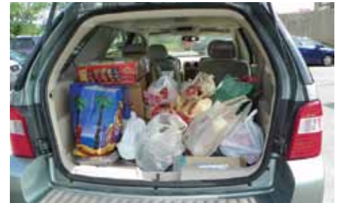
A car packed with goods destined for the Brimfield Relief Center. At left, tornado damage to a house in Brimfield.

The Harrington Auxiliary donated $2,000 to help victims. (See back page for more information.) Harrington's Senior Leadership Team established a Disaster Relief Fund for Harrington employees who have sustained damage to their property or have been forced to use Earned Time to deal with the adverse effects of the tornado and storm. Members of Senior Leadership Team are making donations of Earned Time or donating cash to the fund. Any employee who wishes to donate to this fund is also encouraged to do so. ■